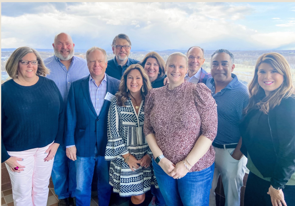
Executive Committee for the Virginia Trial Lawyers Association 2022-2023

I had a great time at the annual Virginia Trial Lawyers Association Summit! I really enjoyed seeing other trial lawyers from across the state and I was able to log some continuing legal education hours (Virginia lawyers need 12 hours per year!). VTLA is a great organization where we all work together to protect the rights of individuals against insurance companies.