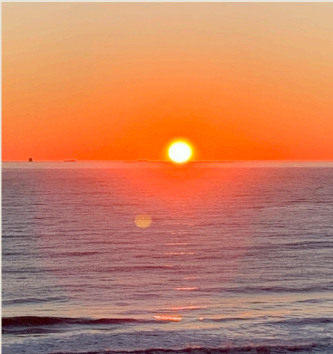
Virginia Beach was a great setting for the tournament.