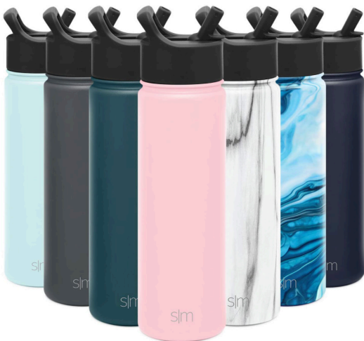
Simple Modern Insulated Water Bottle (Amazon)

Whether you're packing your kindergartener's lunch, or packing your own lunch for the workday, here are some reusable items that will save your wallet, and the planet!