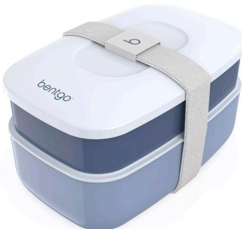
Bentgo Stackable Lunch Box (Target)