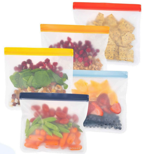
Keeper Reusable Sandwich Bags (Walmart)